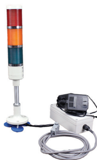
Light Tower Kit*