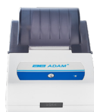
AIP Impact Printer*